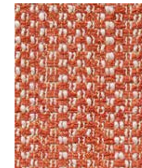
Watson Ibiza 4408