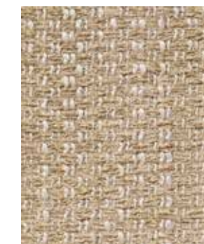
Watson Sponge 4421