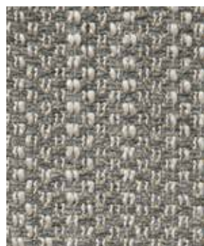
Watson Saturn 4420