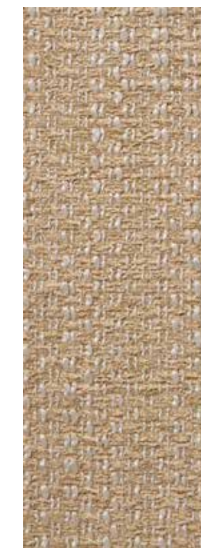
Watson Cameo 4402