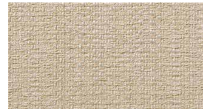
Watson Magnolia 4412