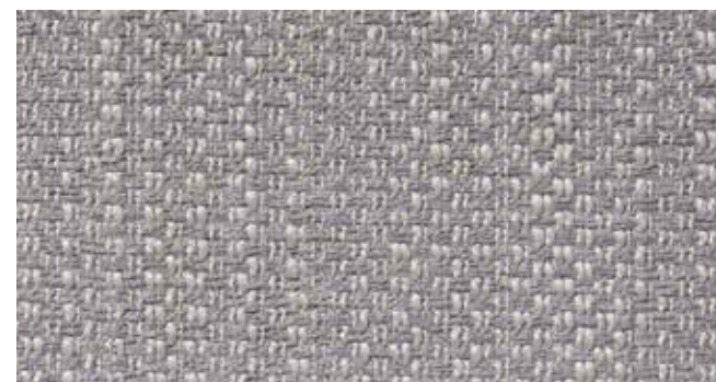
Watson Jersey 4409