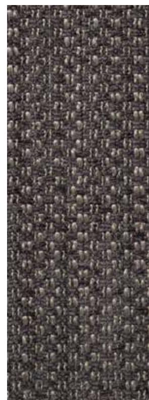
Watson Classic 4404