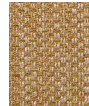
Watson Kashmir 4410