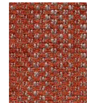
Watson Paprika 4416