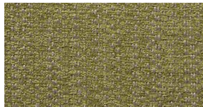
Watson Elm 4405