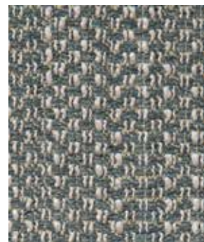
Watson Quail 4417