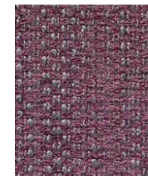
Watson Verbena 4423