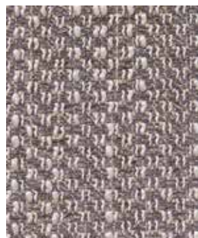
Watson Opera 4415