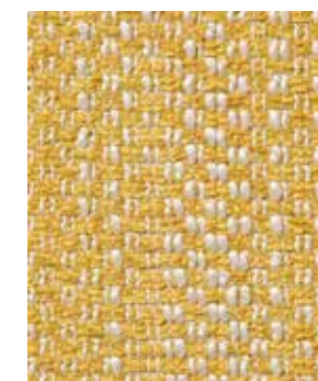
Watson Champion 4403