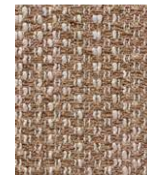
Watson Lynx 4411