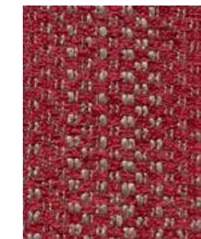
Watson Vixen 4424