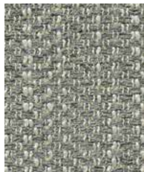
Watson Genie 4407