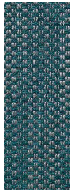
Watson Brook 4401