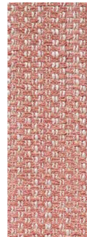
Watson Salmon 4418