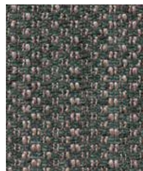
Watson Tasman 4422