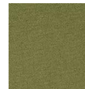
Sørstal Pesto 3617