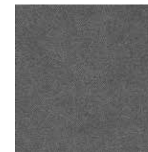
Sørstal Mountain 3615