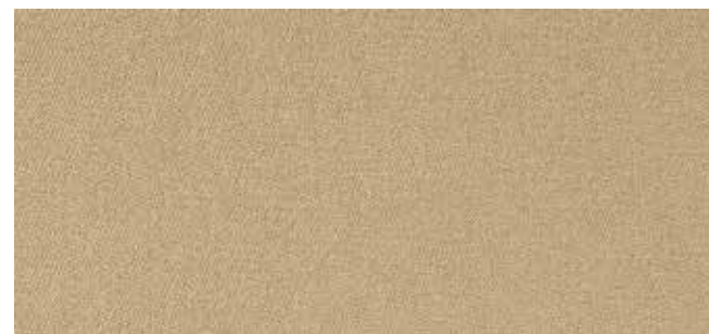
Sørstal Tawney 3624