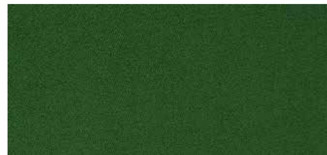
Sørstal Tarragon 3623