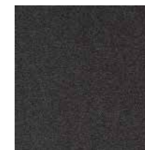
Sørstal Shark 3622