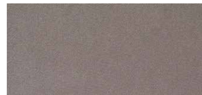
Sørstal Ash 3602