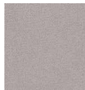
Sørstal Lace 3610