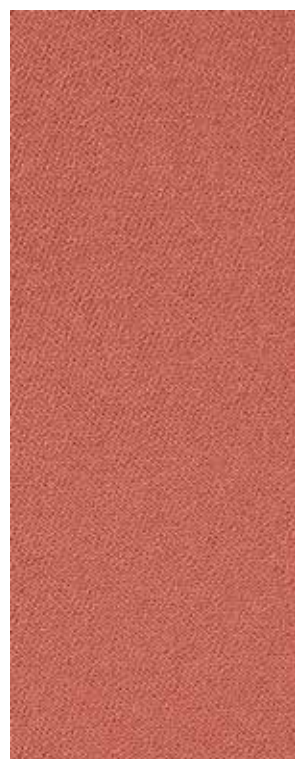
Sørstal Watermelon 3626