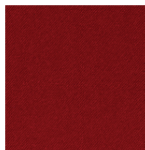
Sørstal Tomato 3625