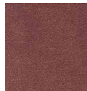
Sørstal Mauve 3612