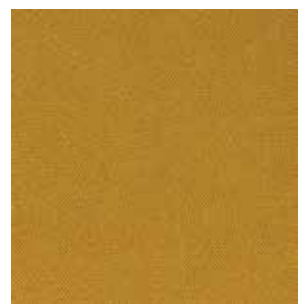
Sørstal Harvest 3608