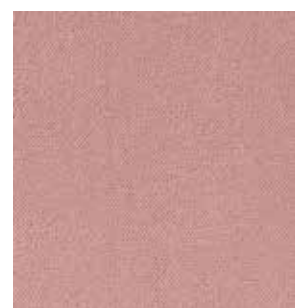
Sørstal Silky Pink 3621