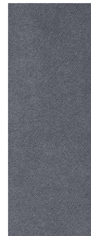
Sørstal Misty Blue 3614