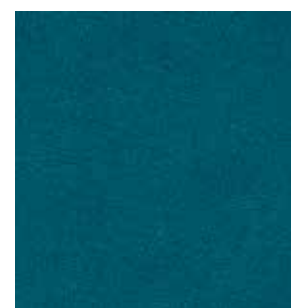
Sørstal Electra 3606