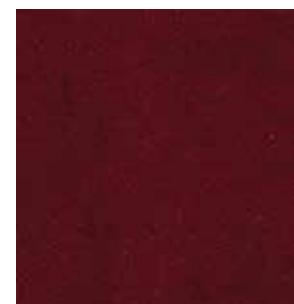
Sørstal Port 3619