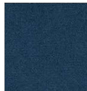
Sørstal Midnight 3613