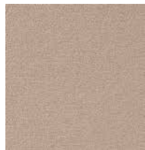
Sørstal Ghost 3607