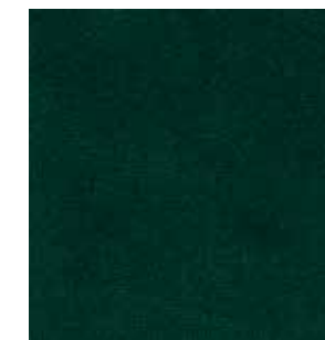
Sørstal Jade 3609