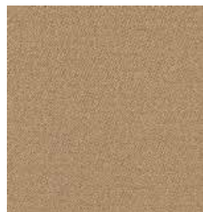
Sørstal Maize 3611