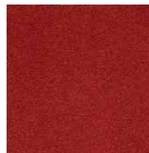
Sørstal Polka 3618