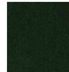
Sørstal Bentley 3603