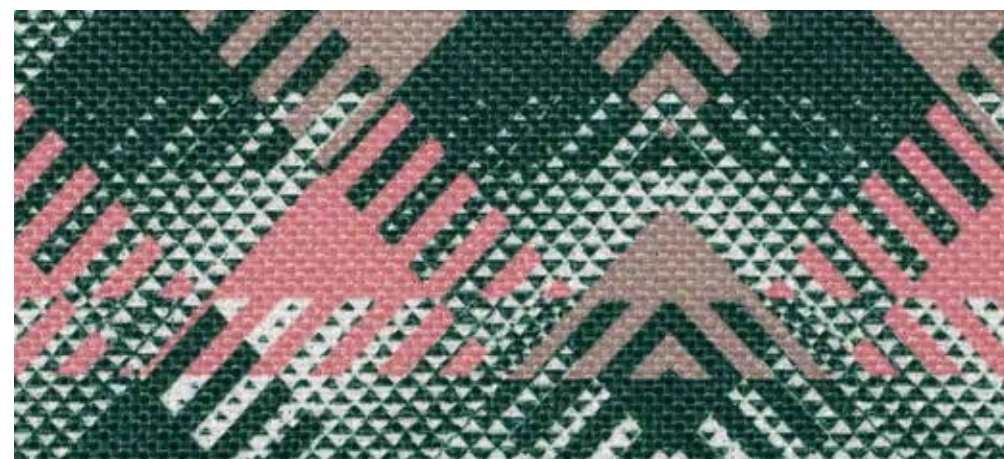
Cascade Peppermint 4104