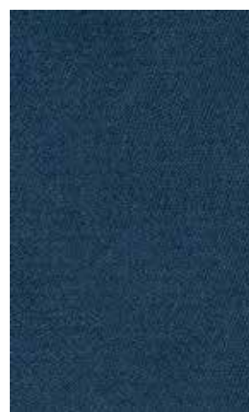
Sørsdal Midnight 3613