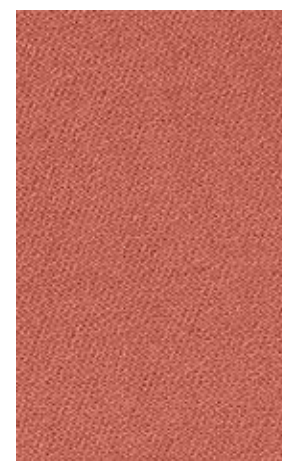
Sørsdal Watermelon 3626