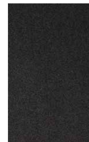
Sørsdal Shark 3622