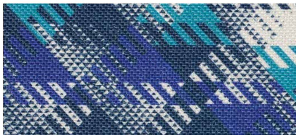
Cascade Caspian 4101