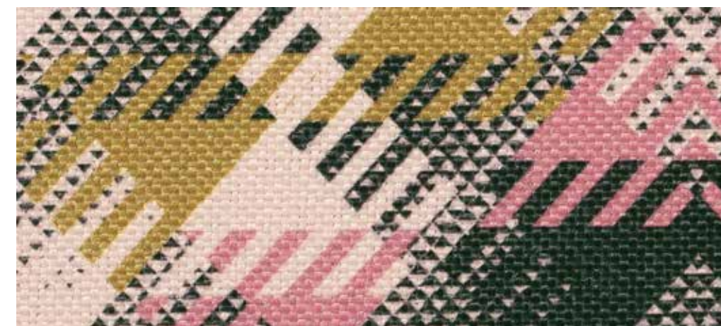
Cascade Mirabelle 4103