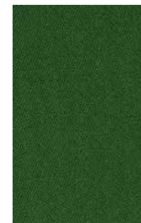
Sørsdal Tarragon 3623