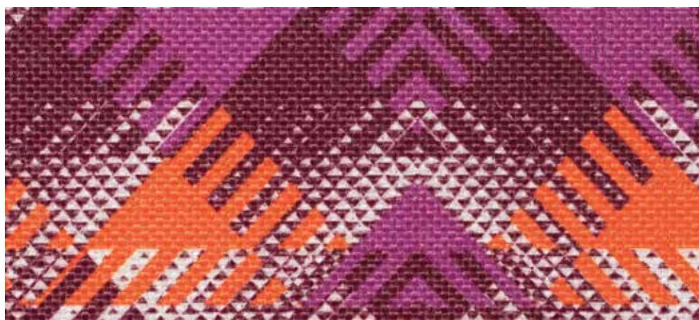
Cascade Jive 4102