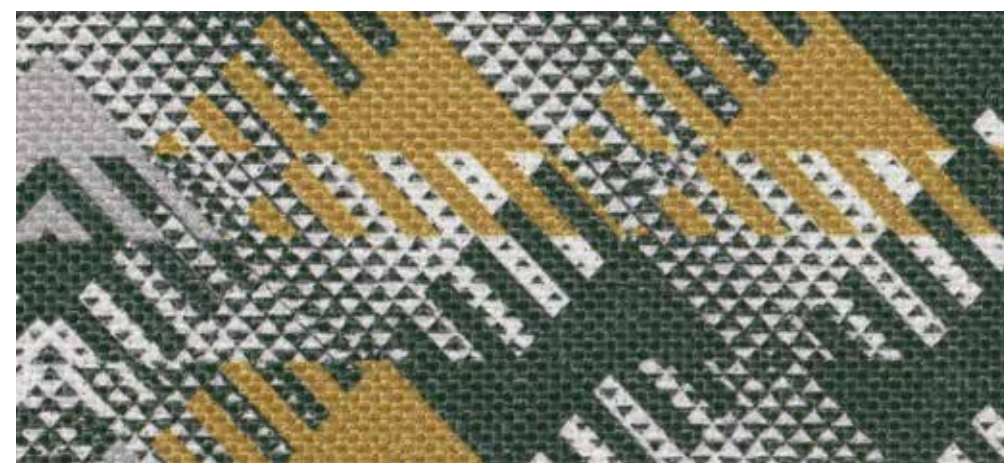
Cascade Pernod 4105