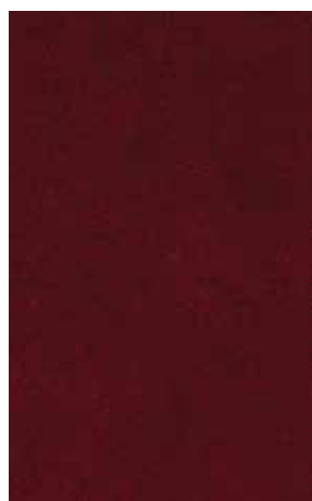
Sørsdal Port 3619