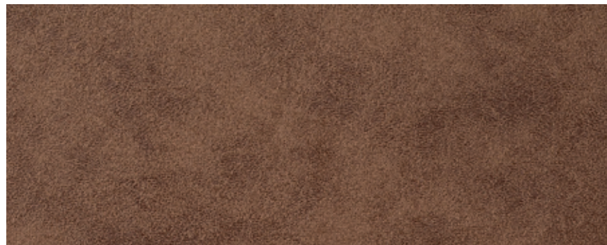
Vintage Brandy 3903