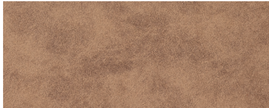
Vintage Champagne 3904