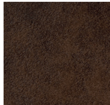
Vintage Thorn 3912

visit www.sunburydesign.com/collections/vintage to see images of these fabrics