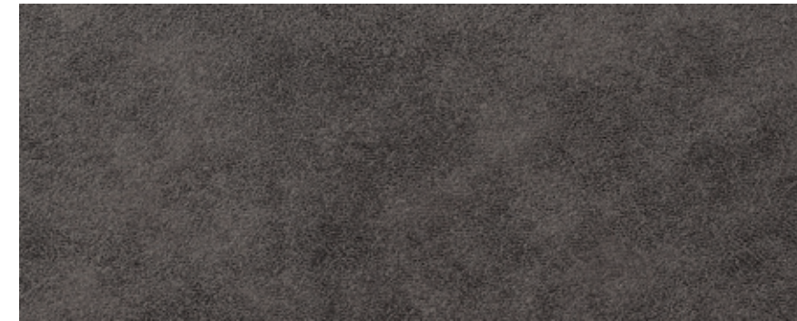
Vintage Aberdeen 3902