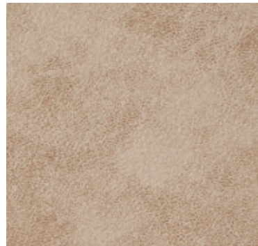
Vintage Satin 3910