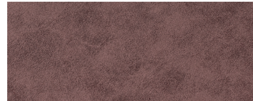
Vintage Rosy 3909

visit www.sunburydesign.com/collections/vintage to see images of these fabrics