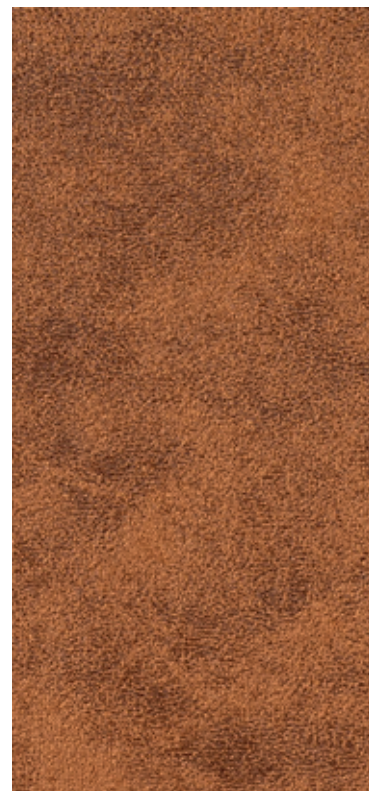
Vintage Copper 3905