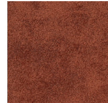
Vintage Tabasco 3911