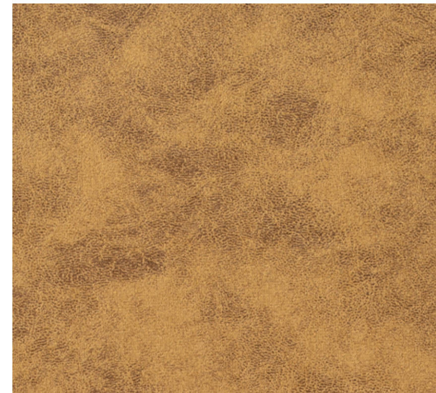
Vintage Goldmine 3907