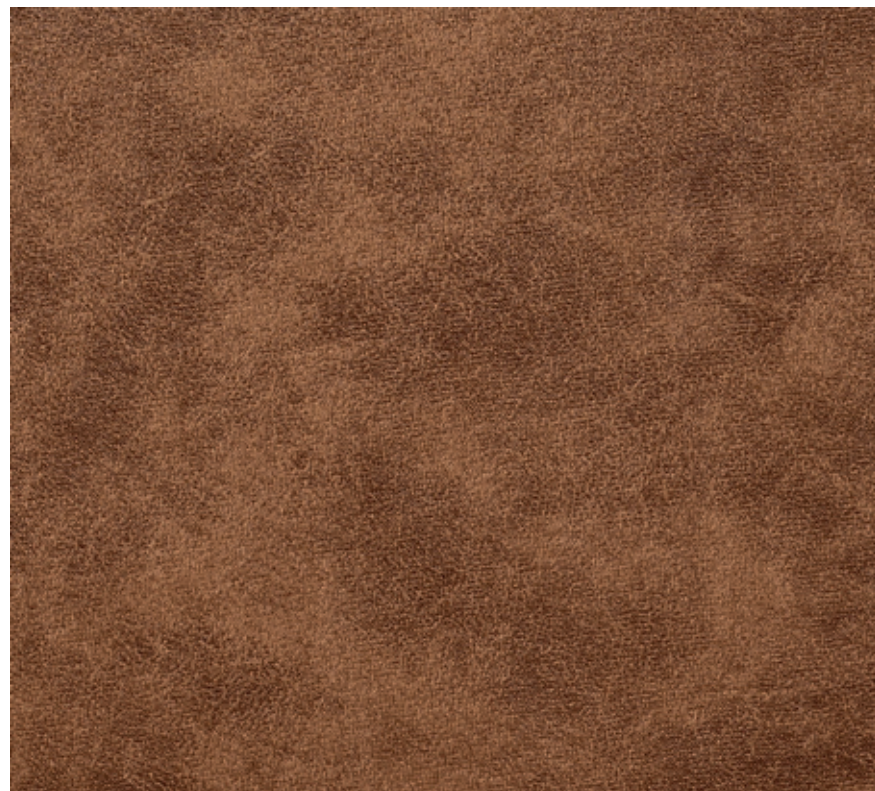
Vintage Allspice 3901