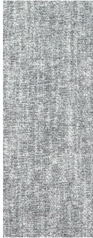
Icon Waterfall 3821