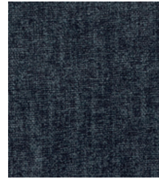
Icon Nightingale 3814