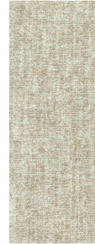
Icon Seashell 3818