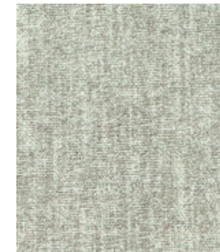
Icon Rye 3817