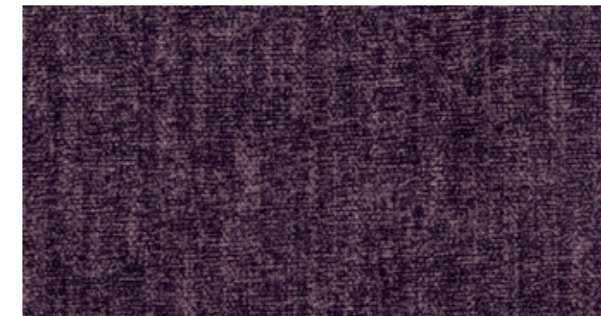
Icon Gemstone 3807

visit www.sunburydesign.com/collections/icon to see images of these fabrics