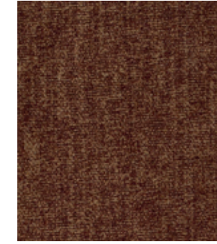
Icon Whiskey 3822