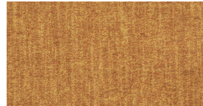
Icon Drambuie 3805