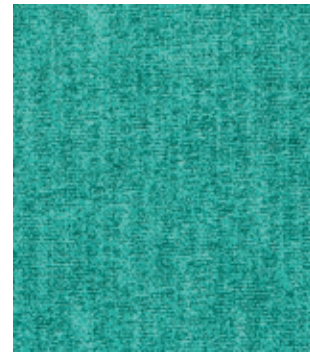
Icon Cassini 3803