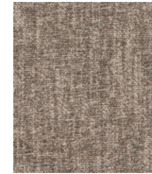
Icon Moccasin 3811