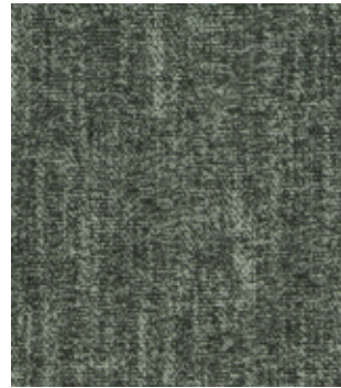
Icon Marble 3810