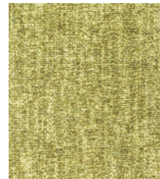
Icon Vegas 3820

visit www.sunburydesign.com/collections/icon to see images of these fabrics