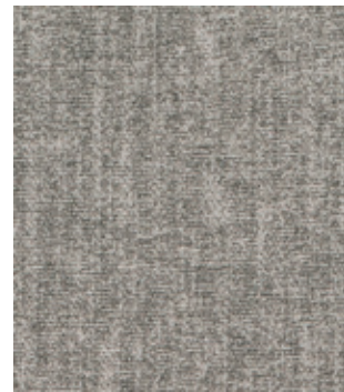
Icon Iceberg 3808