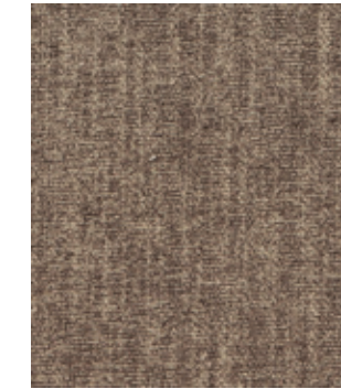
Icon Kabuki 3809