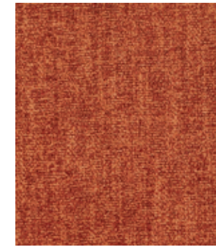
Icon Nebula 3813