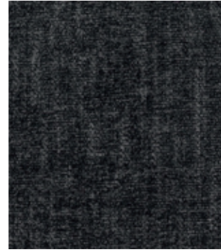
Icon Zinc 3824