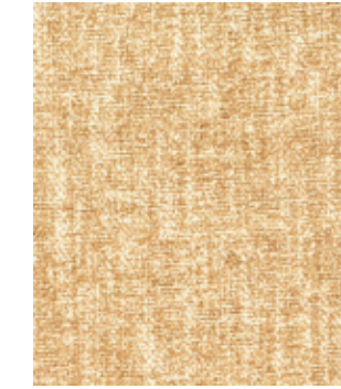
Icon Straw 3819