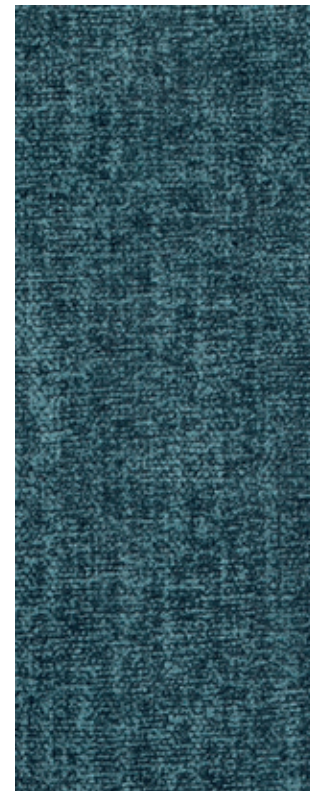
Icon Mystery 3812