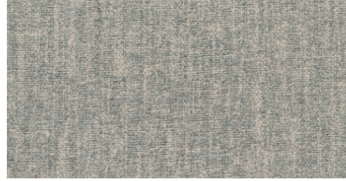
Icon Galileo 3806