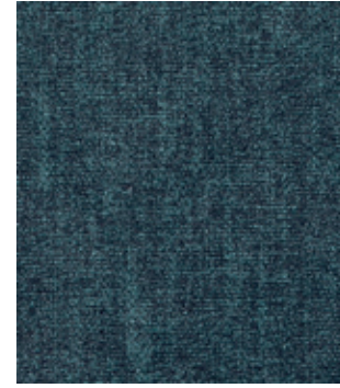
Icon Yale 3823