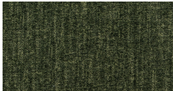
Icon Drake 3804