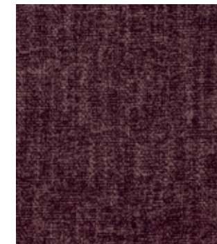
Icon Ophelia 3815