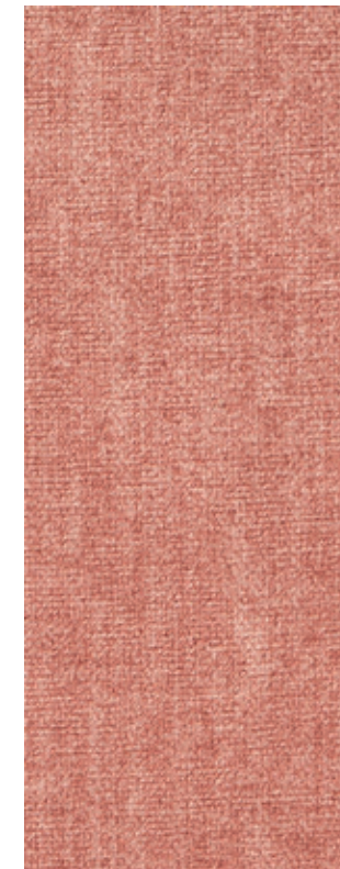
Icon Candyfloss 3802