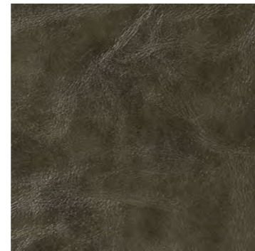
Canyon Lord 4509