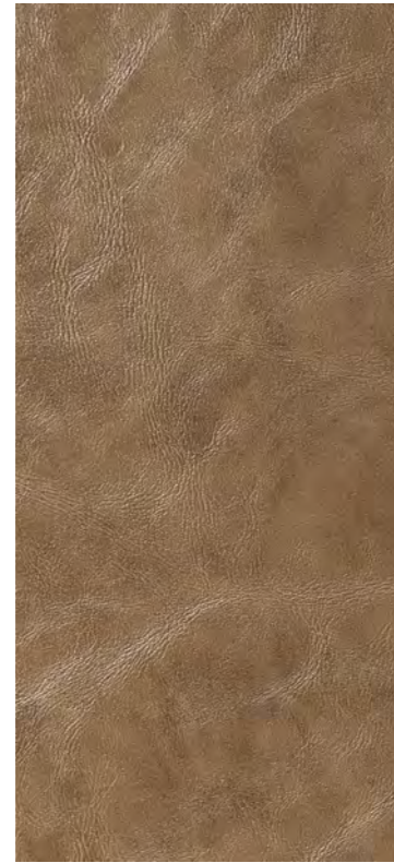
Canyon Gazelle 4506