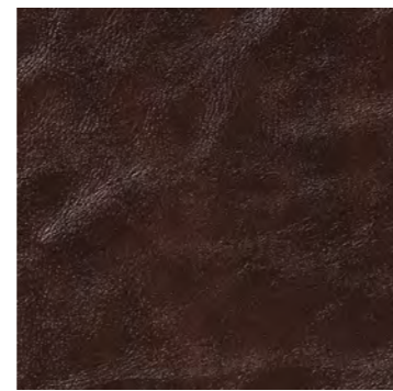
Canyon Hugo 4507