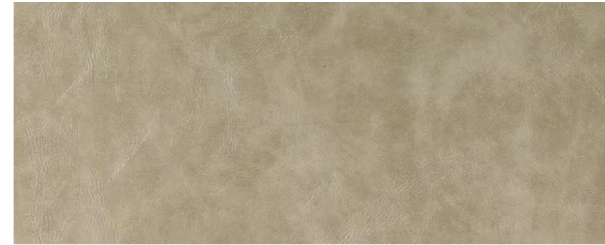
Canyon Fawn 4505