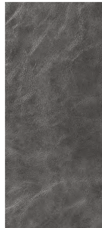
Canyon Trek 4514