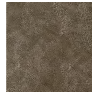
Canyon Cairn 4504