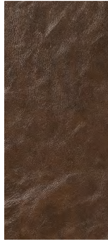
Canyon Aspen 4502