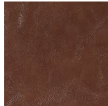
Canyon Loafer 4508