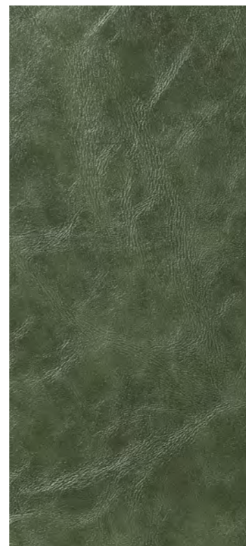
Canyon Treviso 4515