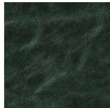
Canyon Wexford 4516

visit www.sunburymdesign.com/collections/canyon to see photos of these fabrics