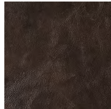
Canyon Monk 4511