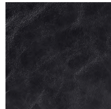
Canyon Molasses 4510