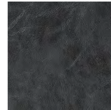
Canyon Burano 4503