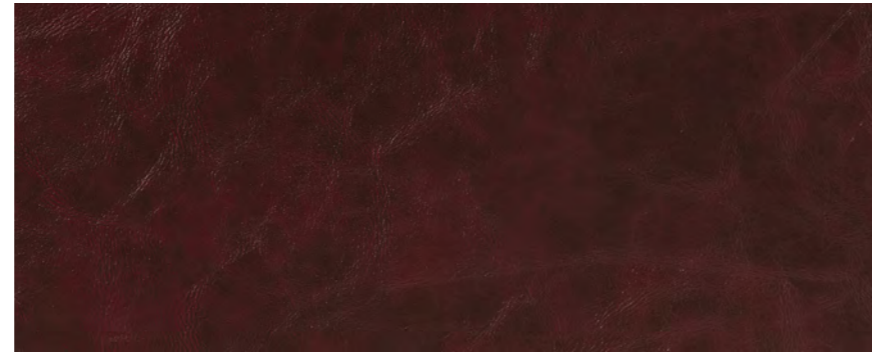
Canyon Setter 4513