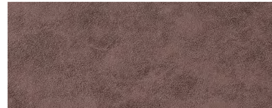
Vintage Rosy 3909

visit www.sunburydesign.com/collections/vintage to see photos of these fabrics