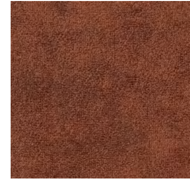
Vintage Tabasco 3911