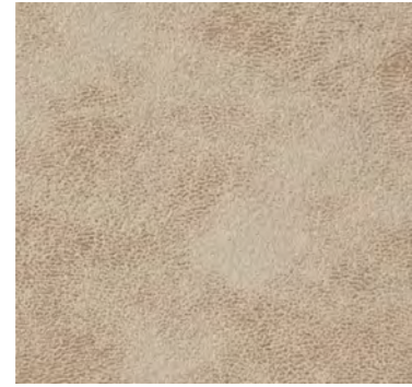
Vintage Satin 3910