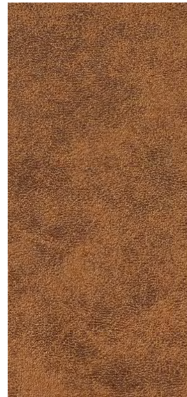
Vintage Copper 3905