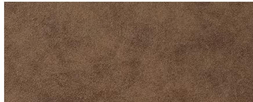
Vintage Brandy 3903