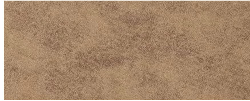
Vintage Champagne 3904