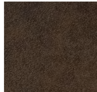
Vintage Thorn 3912

visit www.sunburydesign.com/collections/vintage to see photos of these fabrics