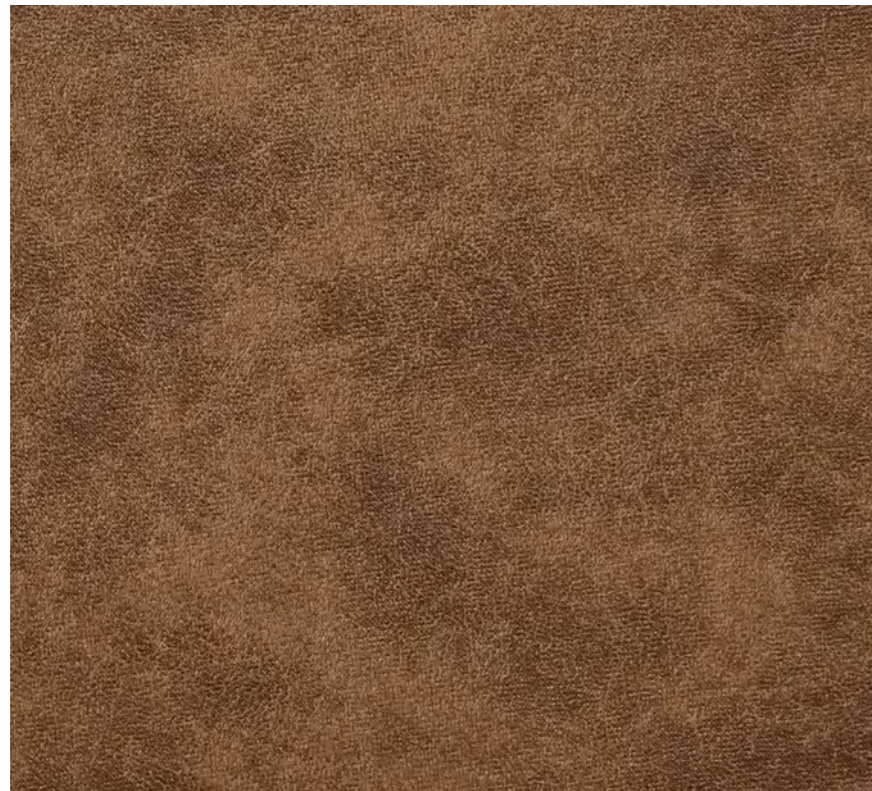
Vintage Allspice 3901