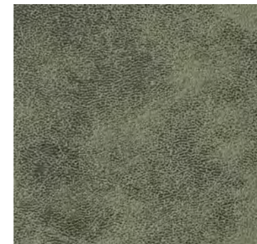
Vintage Fern 3906