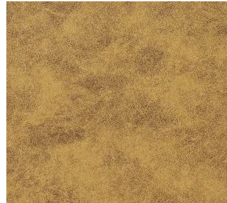
Vintage Goldmine 3907