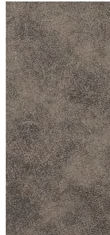
Vintage Graphite 3908