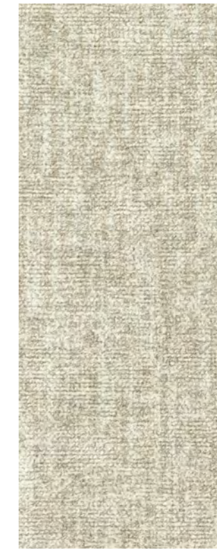
Icon Seashell 3818