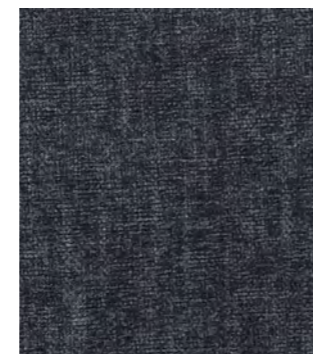
Icon Nightingale 3814