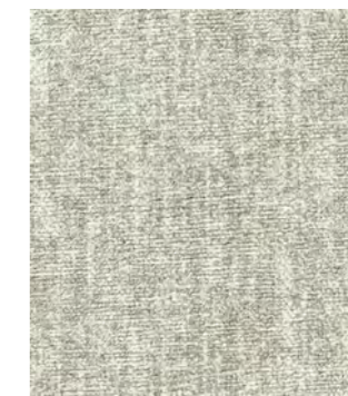
Icon Rye 3817