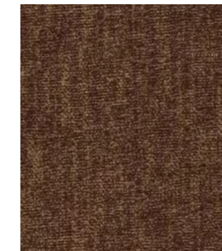
Icon Whiskey 3822