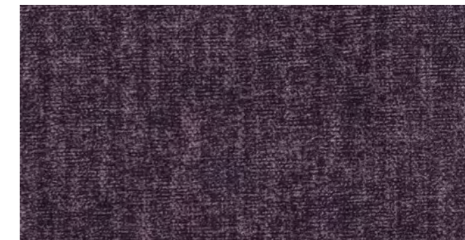
Icon Gemstone 3807

visit www.sunburysunburydesign.com/collections/icon to see photos of these fabrics