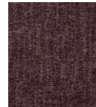
Icon Ophelia 3815