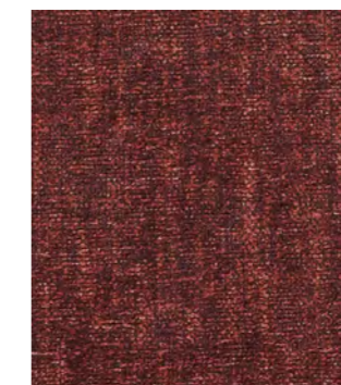
Icon Bloodstone 3801