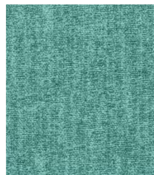
Icon Cassini 3803