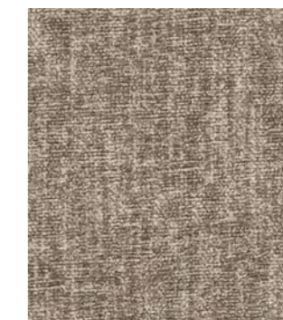
Icon Moccasin 3811