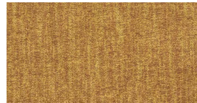
Icon Drambuie 3805