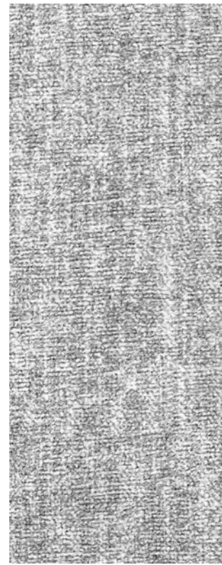
Icon Waterfall 3821