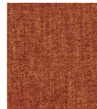
Icon Nebula 3813