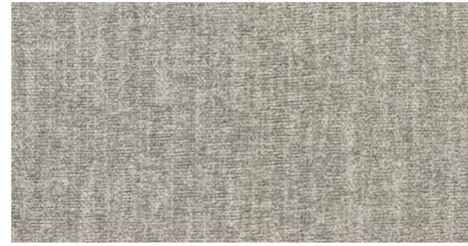
Icon Galileo 3806