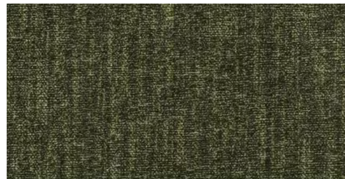
Icon Drake 3804