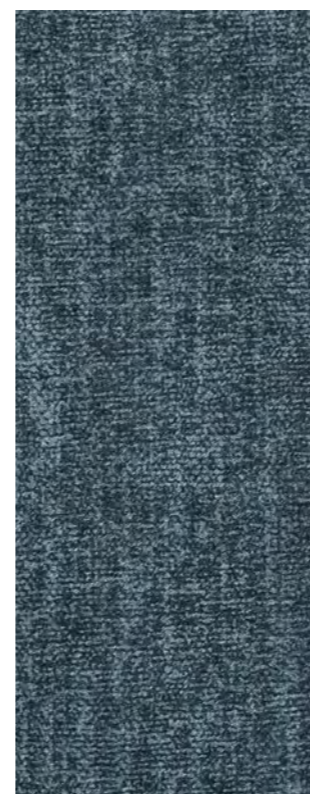
Icon Mystery 3812