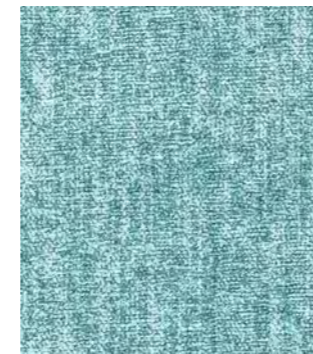
Icon Powder Blue 3816