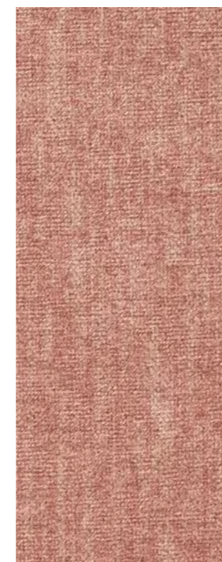
Icon Candyfloss 3802