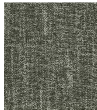
Icon Marble 3810