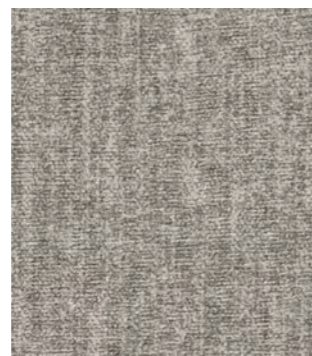
Icon Iceberg 3808