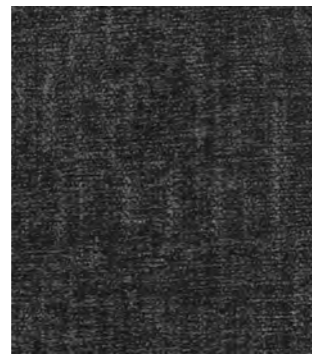
Icon Zinc 3824