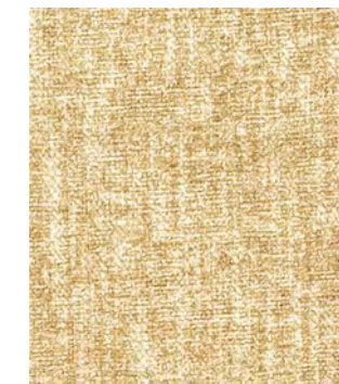
Icon Straw 3819