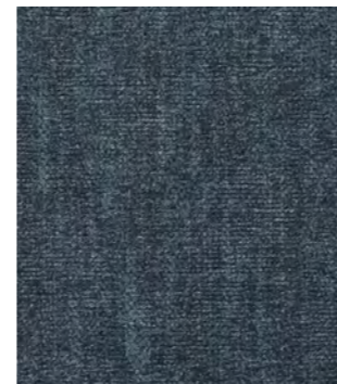
Icon Yale 3823