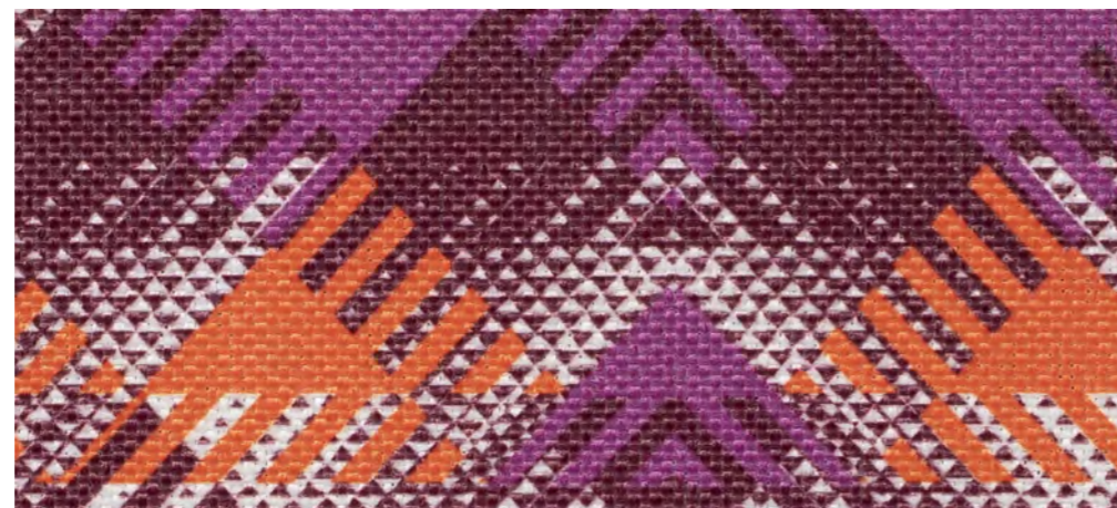
Cascade Jive 4102