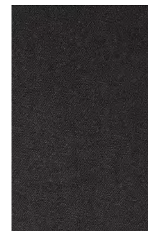
Sørsdal Shark 3622

visit www.sunburydesign.com/collections/cascade to see photos of these fabrics