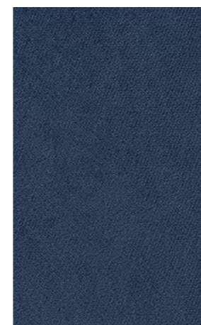
Sørsdal Midnight 3613