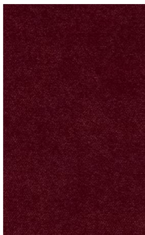
Sørsdal Port 3619