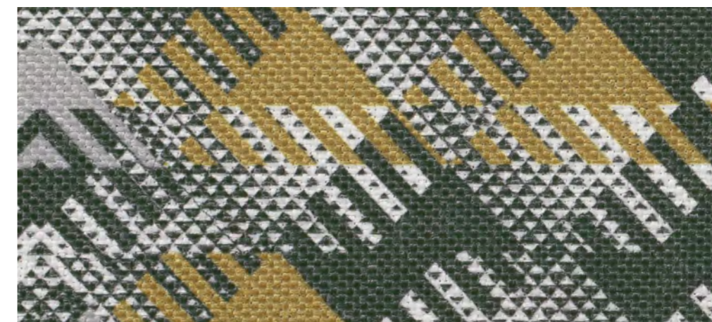
Cascade Pernod 4105