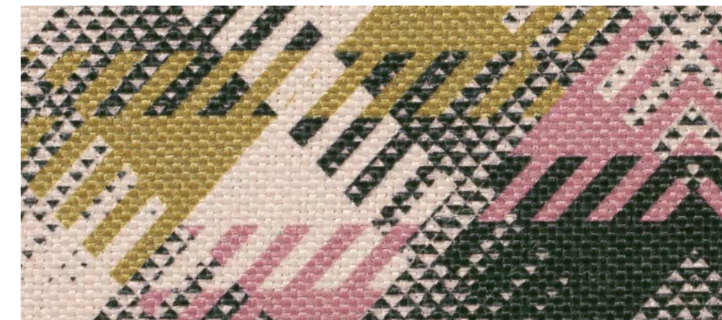
Cascade Mirabelle 4103