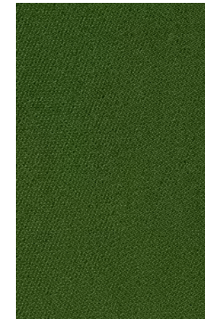
Sørsdal Tarragon 3623