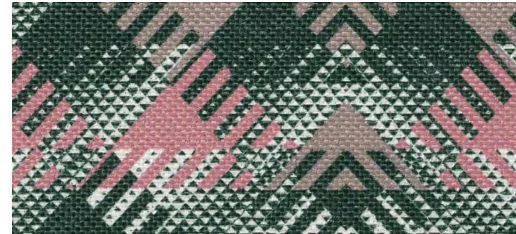
Cascade Peppermint 4104