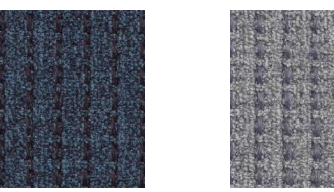
Brera Indigo 2908 Brera Wedgewood 2918