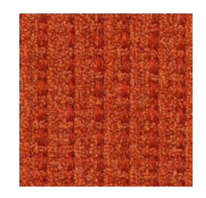
Brera Burnish 2904