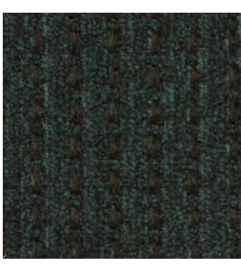
Brera Scout 2915