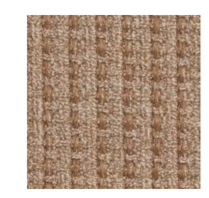
Brera Taupe 2916