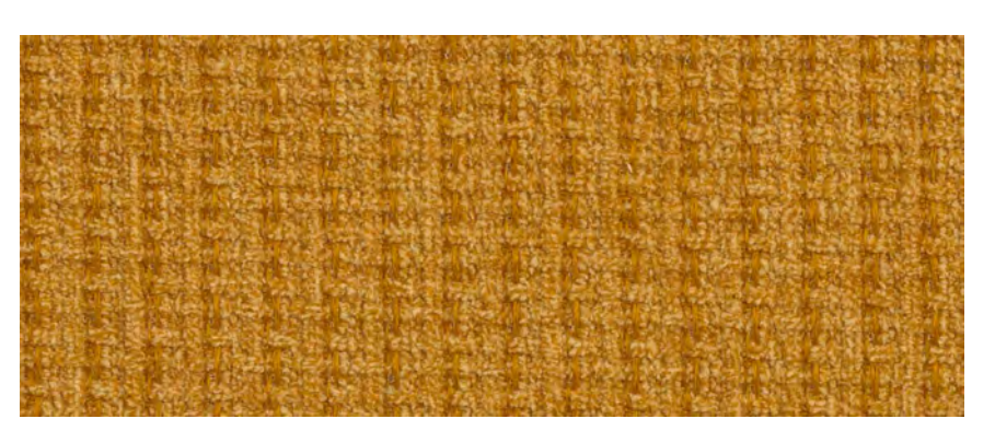
Brera Falun 2907