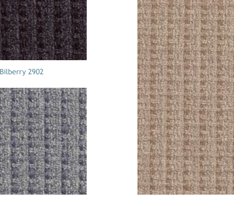
Brera Parasol 2913