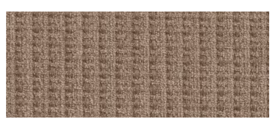
Brera Cortardo 2906 Brera Moonsand 2910