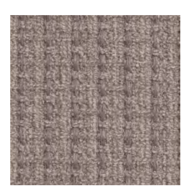
Brera Quartz 2914