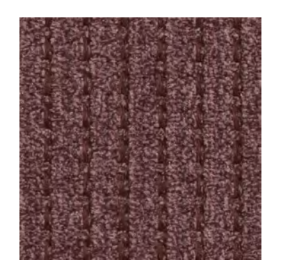
Brera Nirvana 2911