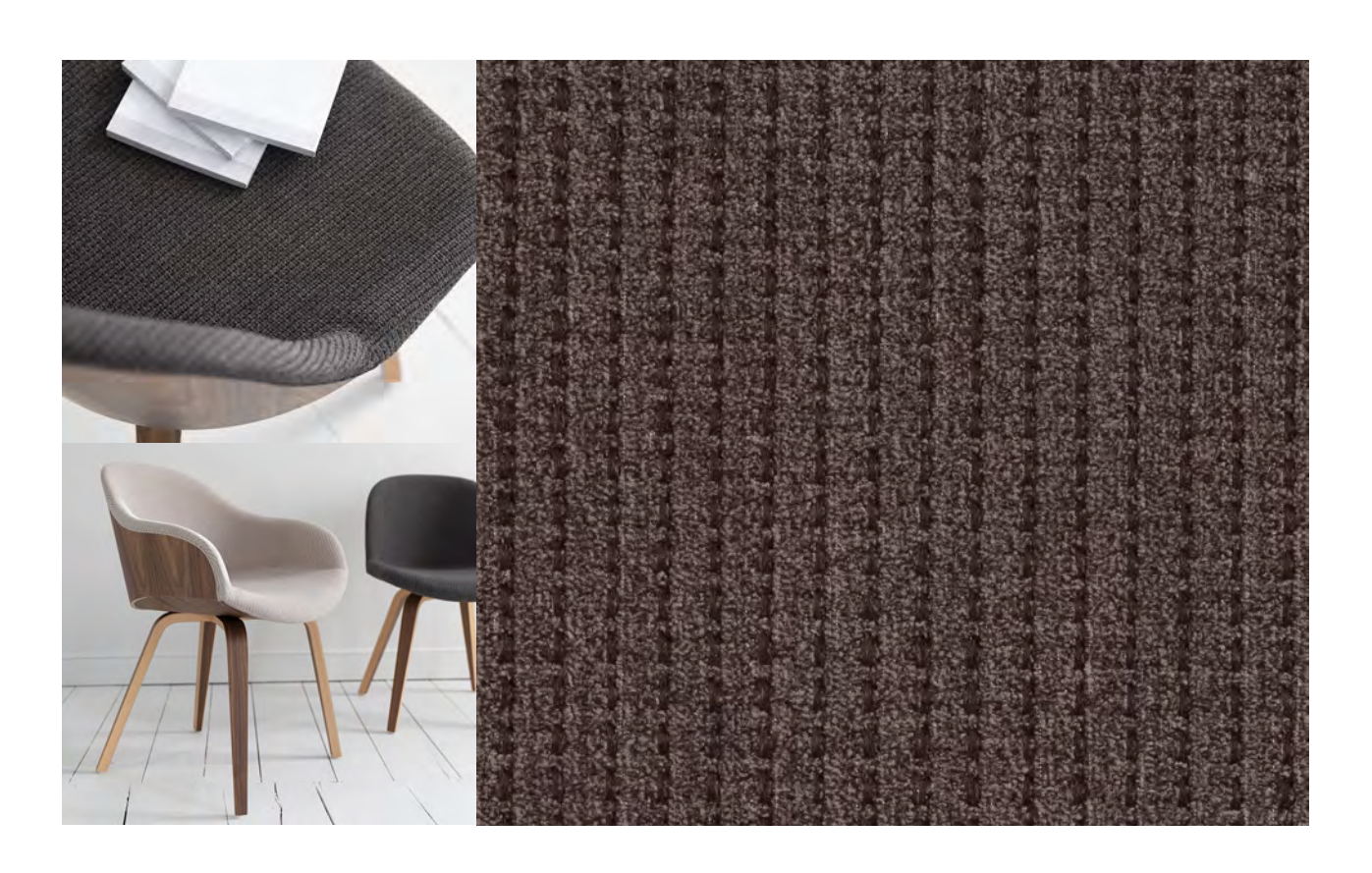
Brera range D29